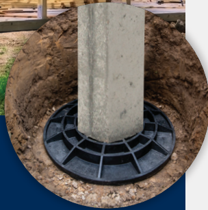
FootingPad shown with Perma-Column® post

FootingPad® footings are engineered using a fiber-reinforced composite that is exceptionally strong, lightweight, and superior to concrete.