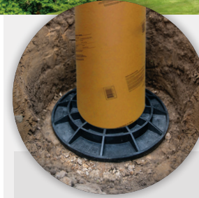
FootingPad shown with concrete tube form

*maximum load based on the psf soil capacity noted