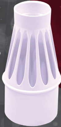
3" FREEZE RELIEF®

During the cold winter months, we need to be concerned about frozen discharge lines. If the line freezes or becomes blocked by the snow or ice, the sump pump will not be able to lower the water level in the pit, causing the pump to continuously run and burn out. Combat these issues with the Freeze Relief®, an overflow device uniquely designed to allow water to exit from the sump pump discharge line in the event of a pipe freezing or other type of blockage. This device works automatically and requires no participation from the homeowner. Once the line thaws, the water will continue to flow along its normal course.